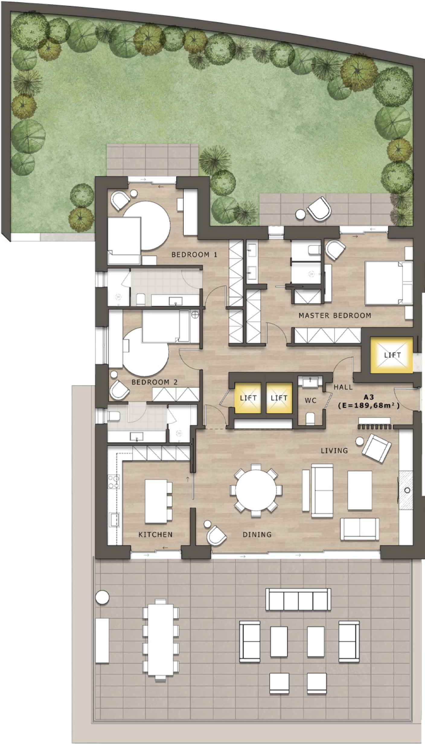
Floorplan of the main floor.