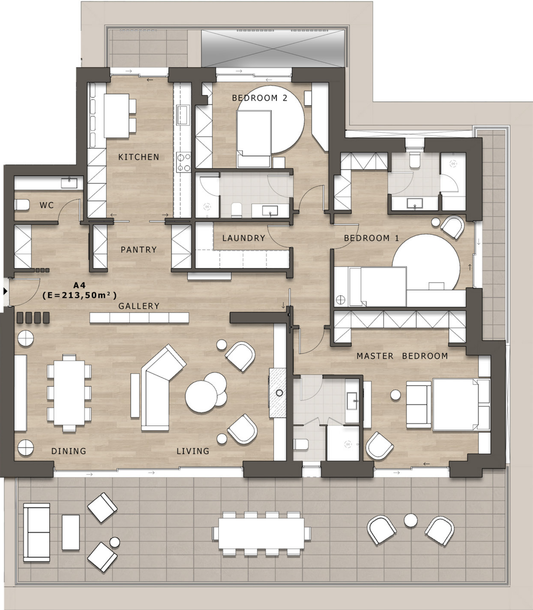
Floorplan of the main floor.