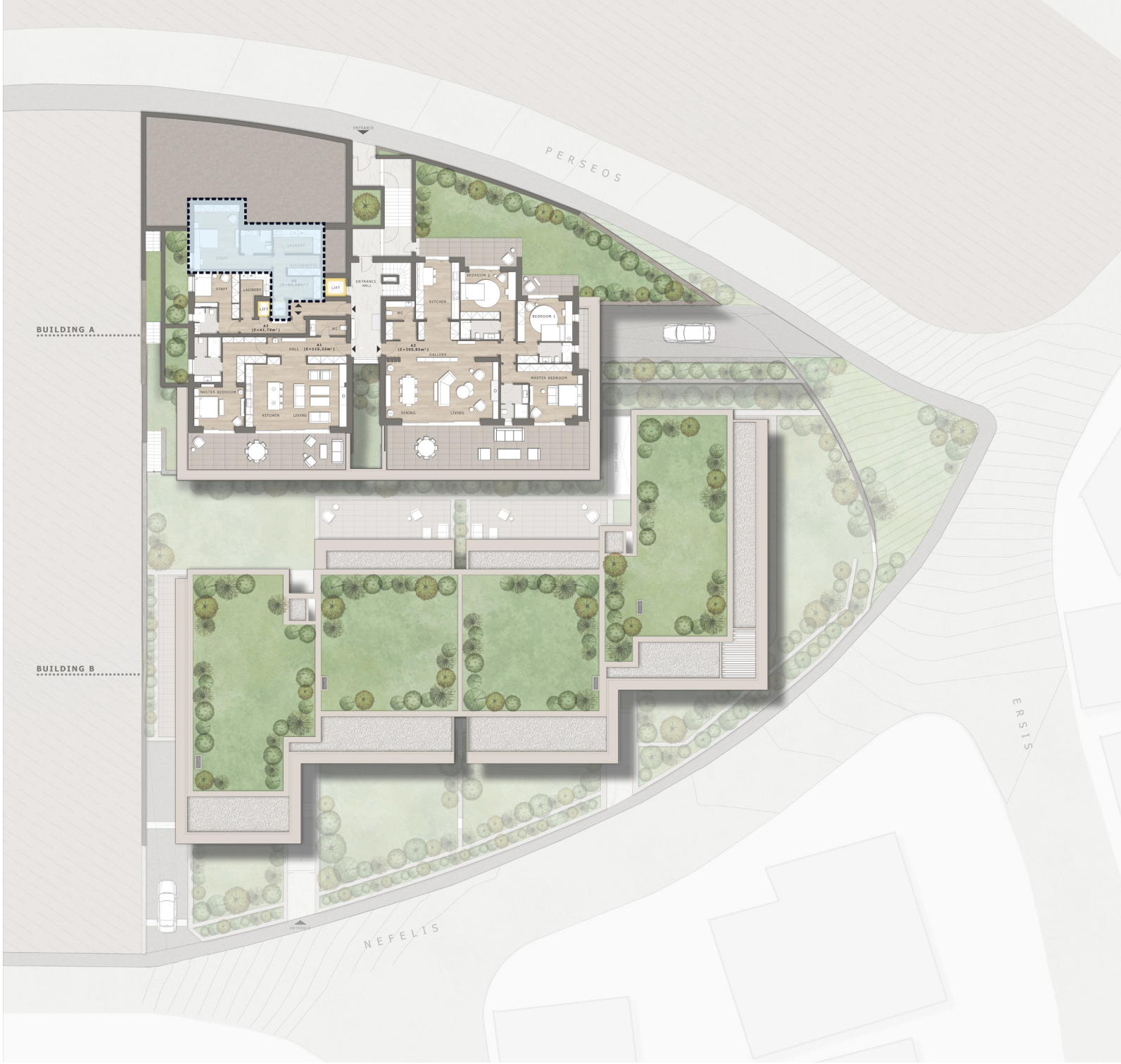
Level 0 / Staff Room & Laundry Facilities 64sqm