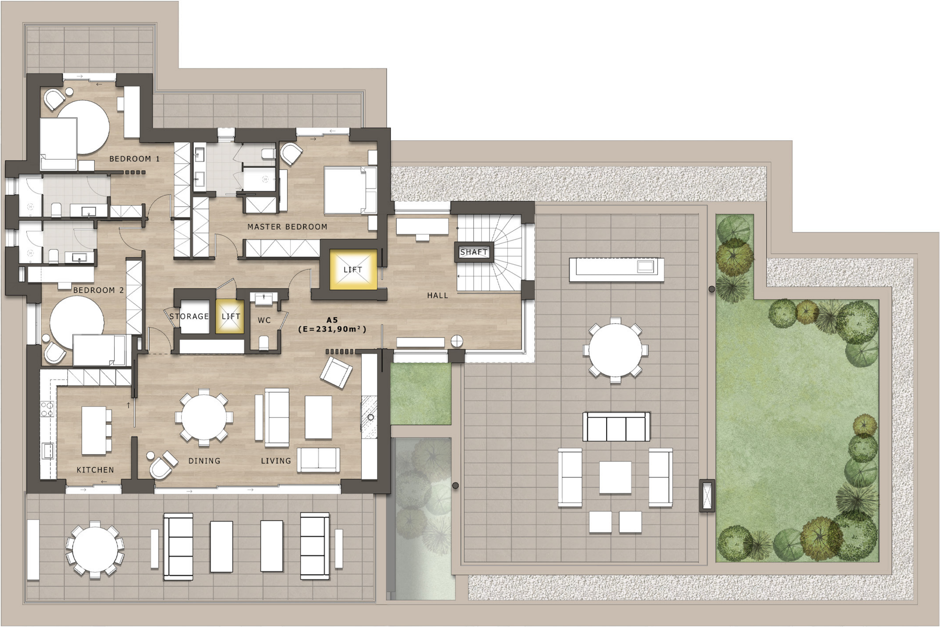
Floorplan of the main floor.

FLOOR PLAN DISCLAIMER Internal areas are measured to the outside boundaries of the exterior walls and include elements within the Unit's outline. Balcony areas are measured as the net area of private balconies attached to the Unit. Garden areas include landscaped spaces and any paved outdoor areas that belong solely to the Unit, including retaining walls or other permanent features forming part of the garden. Please note that changes may occur during construction, and dimensions, fittings, finishes, and specifications may vary without notice. Units are delivered unfurnished, and any furniture or amenities shown are for illustration only.